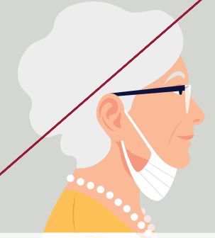
"THE NECK WARMER"

DON'T: Push your mask under your chin so it rests on your neck