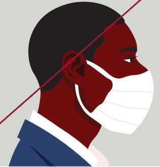
"THE LOOSEY GOOSEY"

DON'T: Wear your mask loosely with gaps on the sides